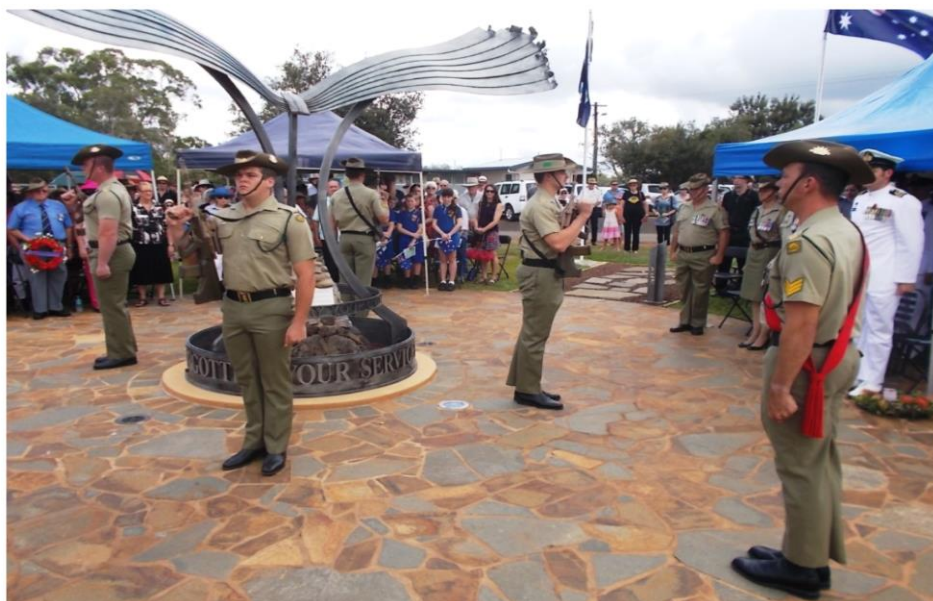
Catapalque Party – 3RAR