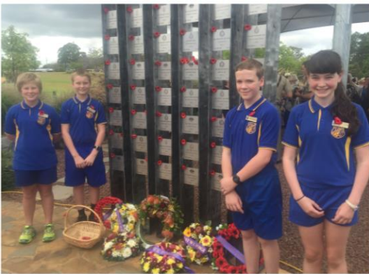
Yungaburra State School Students