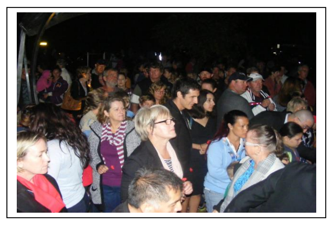
The crowd paying their respects