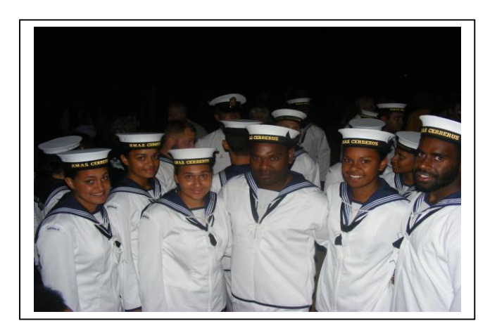
Defence Indigenous Development Program (Navy)